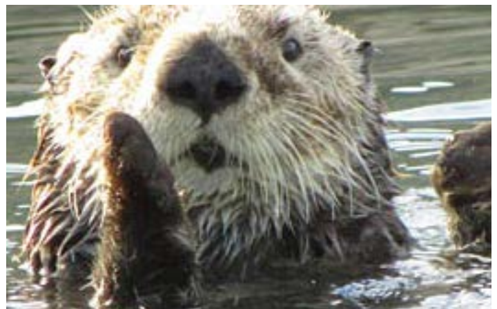
Now, which boat shall I relax on today?