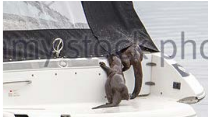
Look! They've covered it up for us! Aren't they sweet...

(sorry about the watermark on the first pic, but I couldn't resist the photo!)