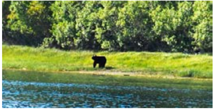
Wildlife seen on the “Extension” Cruise to the West Coast